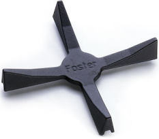
Cast iron wok support